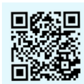
Nutri- Access Report Sample