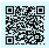
CEO's LinkedIn Profile

[For Printed Copy Only - Links 1, 2, 5 & 6]