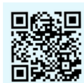
Food curation & Pricing Model